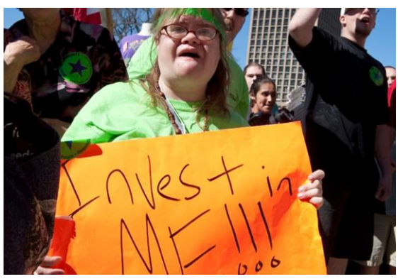
"One voice, your voice, can make a difference"